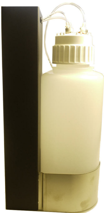
Constant Vacuum Pump