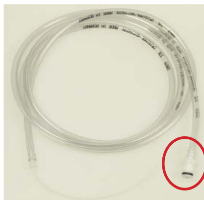
Tube with Connector

The capacity of the waste bottle is 5 liter.