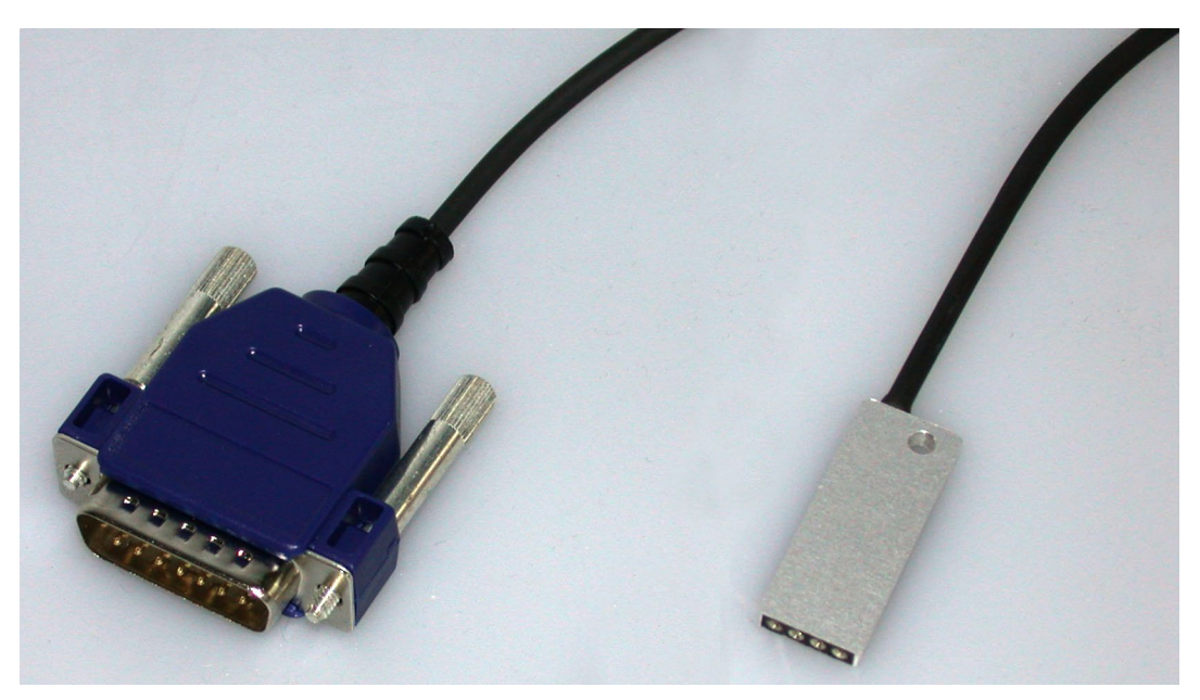
The 2-Channel Miniature Preamplifier MPA2I is connected to the microelectrodes for providing the initial tenfold amplification stage.

It has additional common ground and reference electrode inputs . The reference electrode is ideally identical to the recording electrodes and placed into a comparable but inactive area or tissue. Background or noise signals that are picked up by both the reference electrode and the recording electrodes are removed.